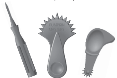
Poker • Super Poker™ • Pounce Wheel

These tools transfer the pattern to your pumpkin.